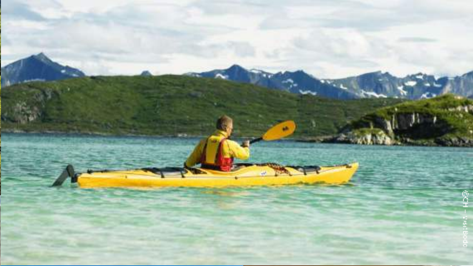
opodrusky - HD ©